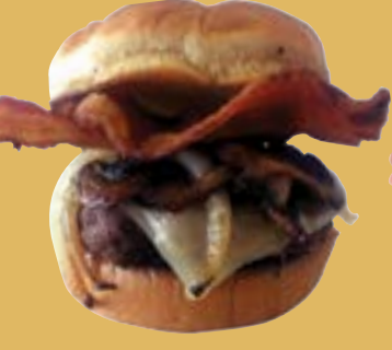
Cowboy Mushrooms, onions, bacon & Swiss cheese