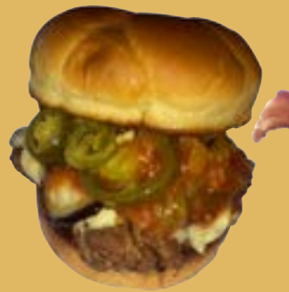
3-Alarm Pepperjack cheese, jalapenos, grilled onions & salsa

Grilled Smash Burger with your choice of side Single $12.99 Double $16.99 Triple $21.99