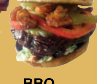
BBQ Grilled onions, BBQ sauce, lettuce, tomato & pickles